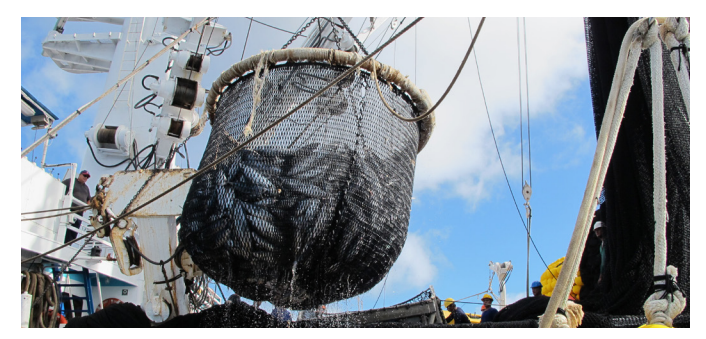
ISSF (2012)/Photo: David Itano

• Ensure 100% observer coverage (human or electronic) requirements apply, including for vessels engaged in supply & tender activities.